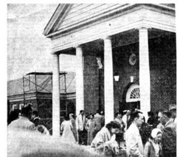
March 31, 1957 – Members leave St. Peter's after first worship service. Note the scaffolding in the background.

While St. Peter's congregation settled into its new building, the United Church of Christ was being born in Cleveland, Ohio. June 25, 1957 marks the beginning of the new United Church of Christ. The cover of the Dedication booklet for St. Peter's states, "Saint Peter's Evangelical and Reformed Church – Affiliated with The United Church of Christ". 1957 was a very busy year!