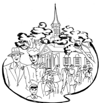
Cover art from Church Growth and Outreach booklet (late 1950s). Artwork by Mace West.

Now as we look forward from 2007, St. Peter's finds itself in transition once again. Without a current pastor, we continue from week-to-week using pulpit supply pastors as we seek an interim pastor and eventually, a permanent pastor. And like 50